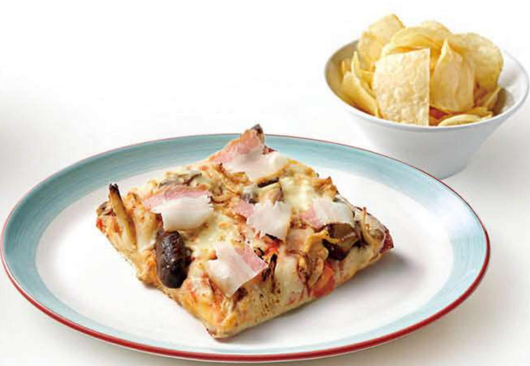
蘑菇薄餅 蘑菇、煙燻五花肉、焦糖洋蔥 Mushroom Pizza Mushroom, Smoked Pork Belly, Caramelized Onion