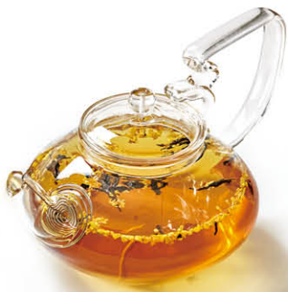
松風詠桂 金桂花、舞茸、 武夷水仙

Flora Blossom Osmanthus, Maitake Mushroom, Bo Hea Suey Sian