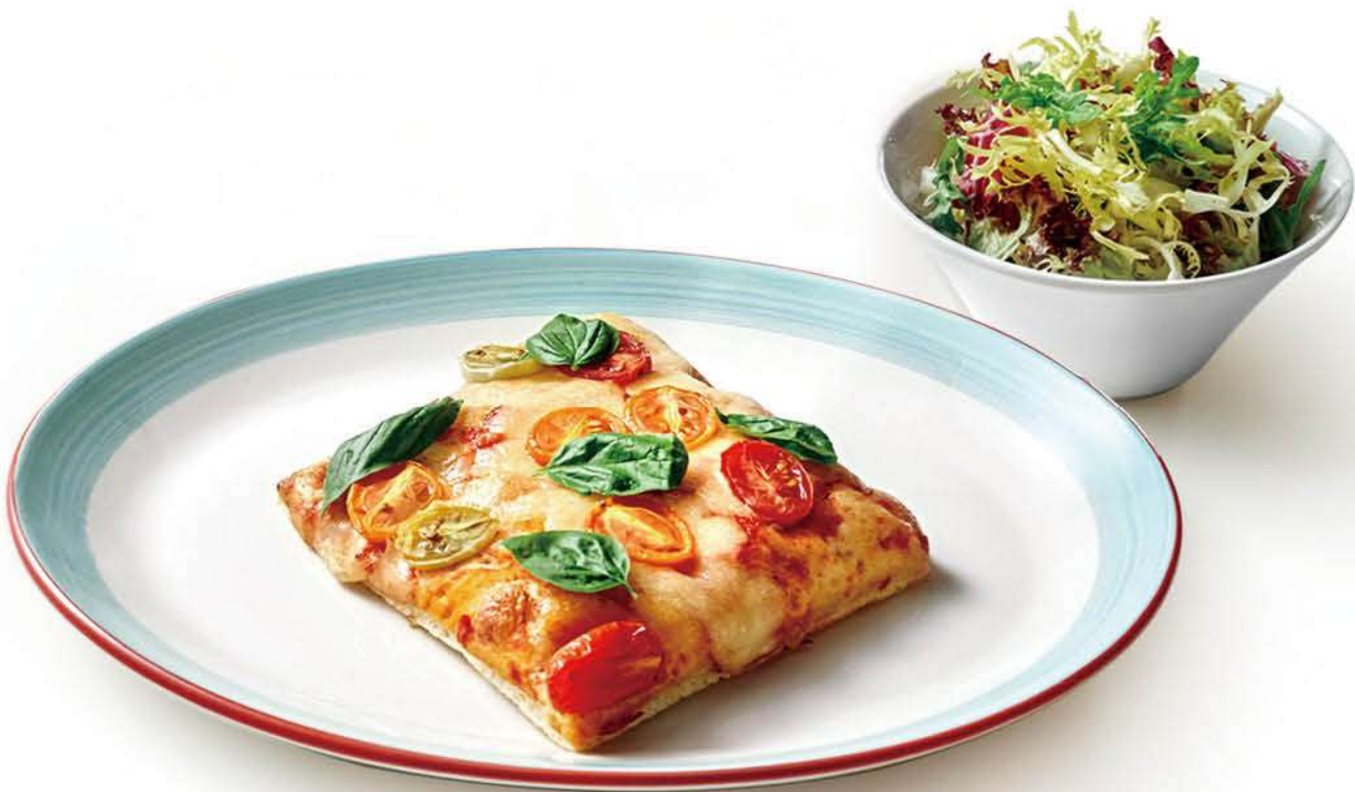
瑪格麗特 水牛芝士、蕃茄、羅勒 Margherita Mozzarella, Tomato, Basil