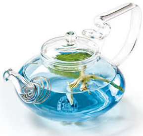
薄荷薑汁茶 蝶豆花、甜菊葉、 雲霧綠茶

Ginger Peppermint Tea Butterfly Pea, Stevia Leaf, Green Tea