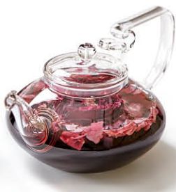
玫瑰花話梅茶 墨玫瑰花、桑葚、 黑杞子、浙江紅茶

Rose and Plum Tea Crimson Glory Rose, Mulberries, Black Wolfberries, Black Tea