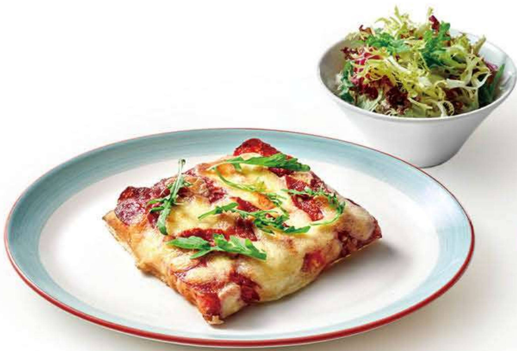
意大利 辣肉腸薄餅 蕃茄、馬蘇里拉芝士、 辣肉腸、芝麻菜 Diavola Tomato, Mozzarella, Spicy Salami, Arugula