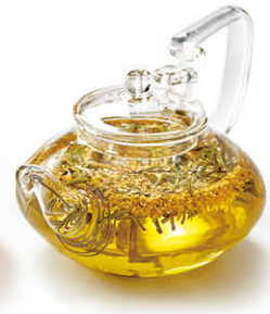
甜蜜桂花茶 甜菊葉、金絲皇菊、 毛峰綠茶

Sweet Osmanthus Tea Stevia Leaf, Chrysanthemum, Green Tea