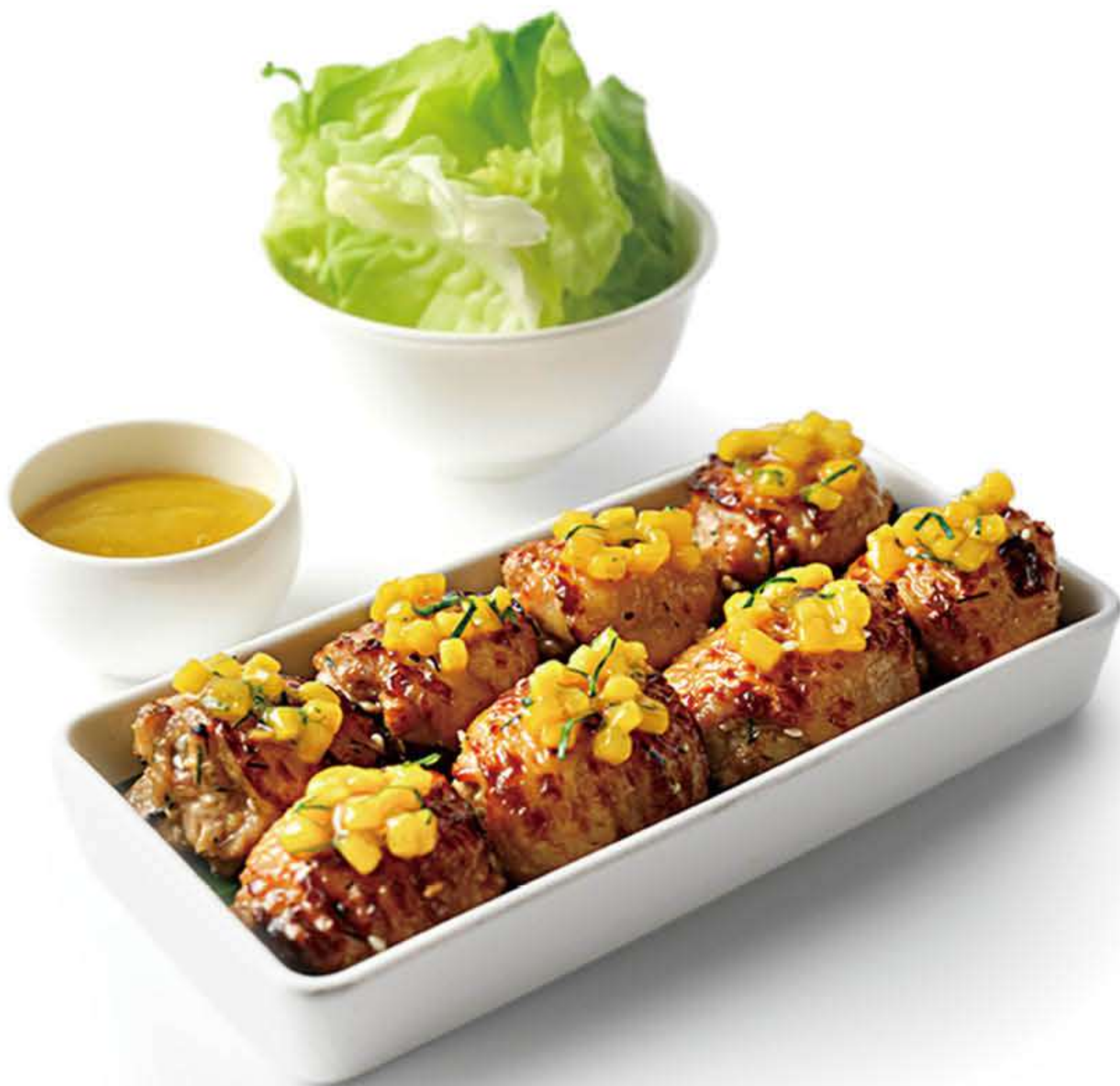
雞翅 芒果沙律醬、生菜 Chicken Wings Mango Salsa, Butter Lettuce