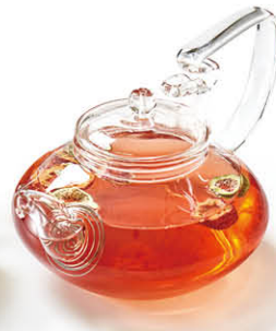
山楂無花果茶 洛神花、 桂圓、杞子

Hawthorn and Fig Tea Roselle, Dried Longan, Wolfberries