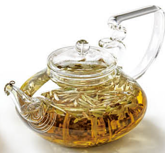
青香玉翠 銀針白茶、茉莉綠茶、 梔子花

Jade Forest White Tea, Jasmine Tea, Gardenia