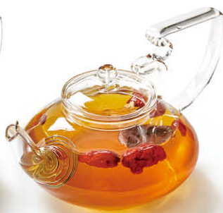
遊鶴延喜 癸巳年白牡丹、 梅江陳皮、杞子、紅棗

Citrus Sensation Aged White Tea, Aged Tangerine Peel, Wolfberries, Red Dates