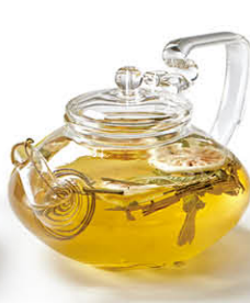
香檸薑茶 香茅、馬鞭草、 香水檸檬、正山小種

Lemongrass Ginger Tea Citron, Lemon Verbena, Black Tea