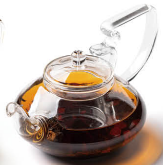
宮廷金芽茶 宮廷普洱、 野生牛蒡