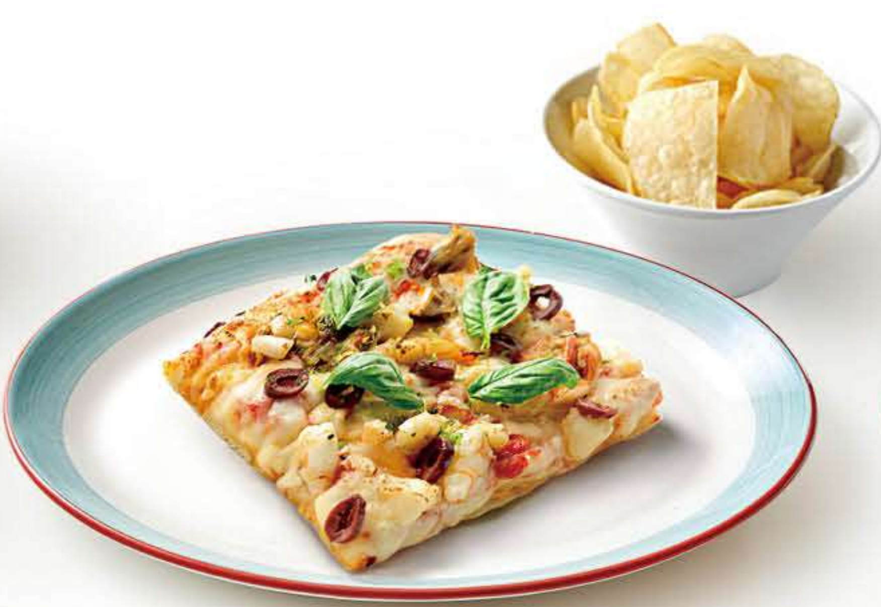
海鮮薄餅 蝦、魷魚、羅勒、卡拉馬塔、青檸 Seafood Pizza Shrimps, Squid, Basil, Kalamata, Lime Zest