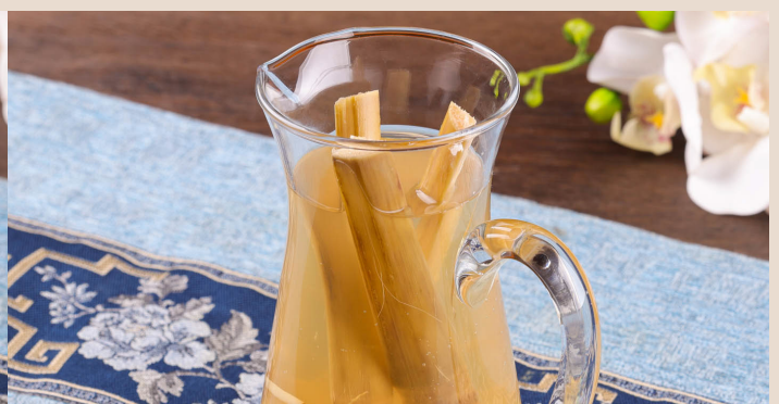
竹蔗茅根馬蹄水 Sugar cane, imperata and water chestnut water