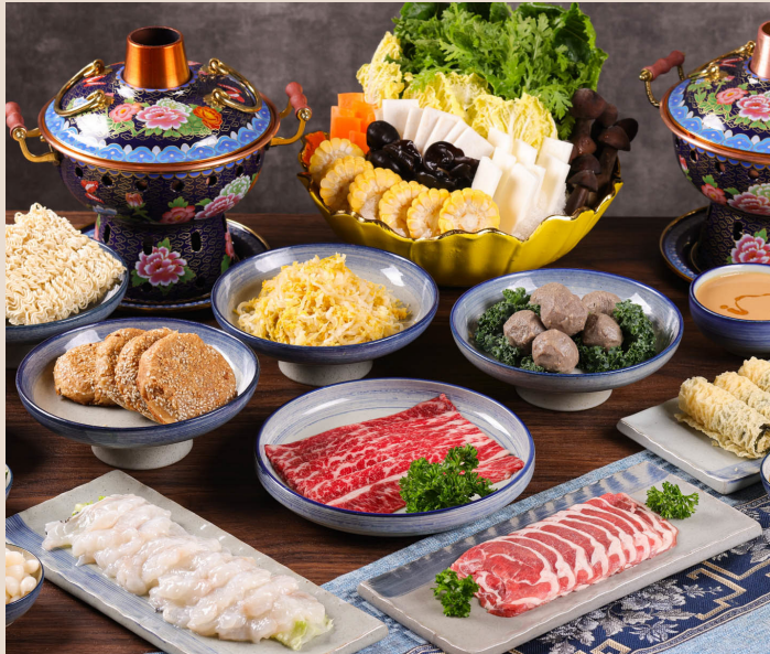
老北京銅鍋涮肉《4-6人套餐》 Imperial Beijing Hotpot (Set for 4-6 persons)