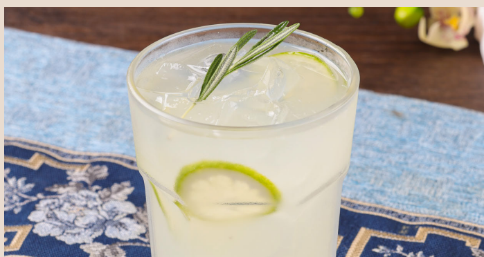
海椰香檬冰茶 Coconut water and lemon ice tea