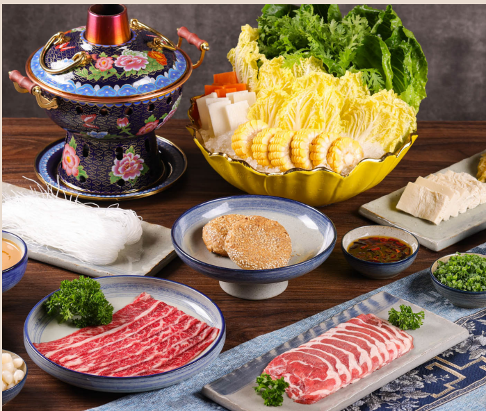
老北京銅鍋涮肉《2人套餐》 Imperial Beijing Hotpot (Set for 2 persons)