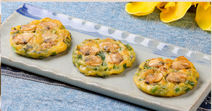
煎韭菜蛤蜊玉米餅 Pan-fried corn cake with chives and clams