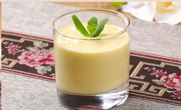
芒果椰香牛油果奶昔 Coconut, avocado and mango milkshake