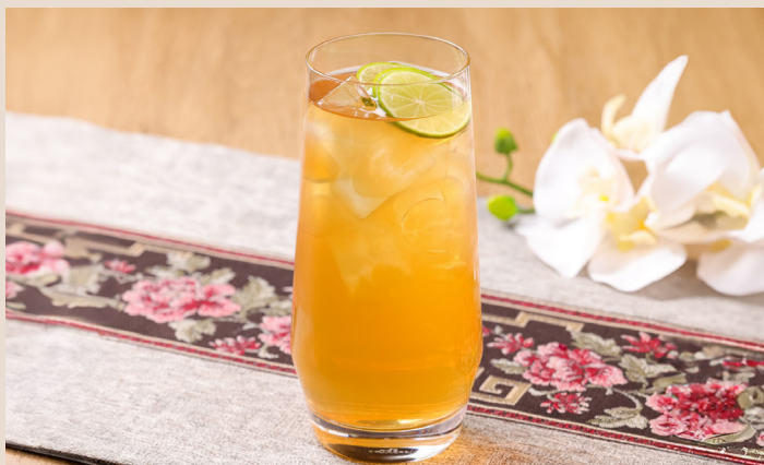
鴨屎香青檸茶 Iced Oolong tea with lime