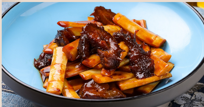
油燜春筍燒海參 Braised sea cucumber with spring bamboo shoots