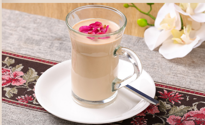
紅玫瑰伯爵奶茶 Red rose and earl grey milk tea