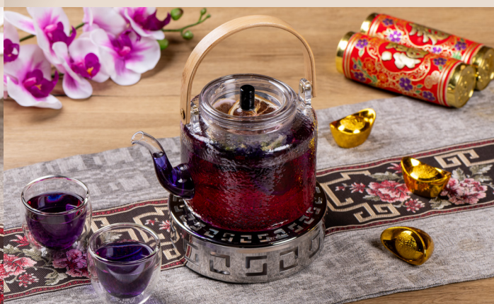
蜂蜜檸檬蝶豆花茶 Butterfly pea tea with lemon and honey