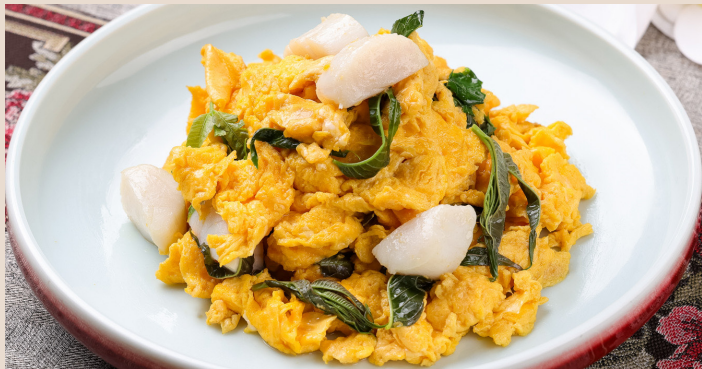
香椿苗貝丁炒滑蛋 Stir-fried scrambled egg with toona sinensis and scallops