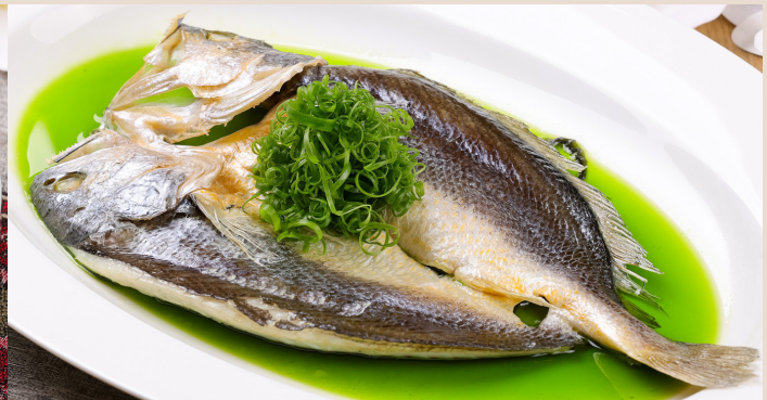
蔥香雞油蒸黃魚 Steamed yellow croaker with chicken and scallion oil