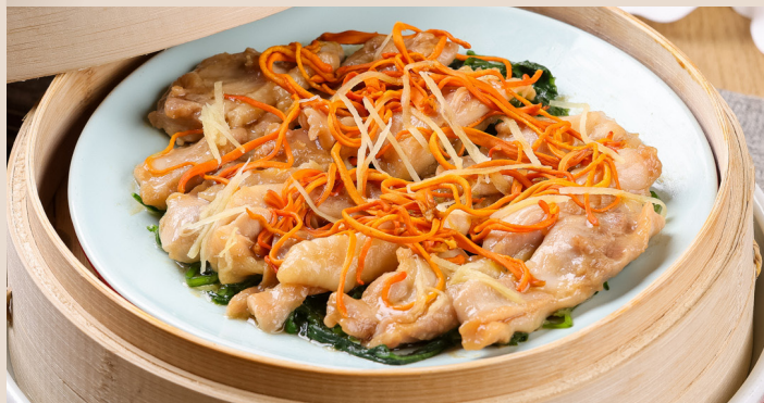
蟲草花薺菜蒸滑雞 Steamed chicken with cordyceps flower and shepherds purse