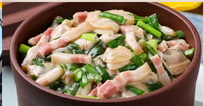
韭菜鹹肉蛤蜊焗飯 Steamed rice with pork, chives and clams