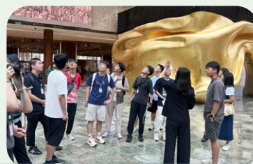
Sustainable Development Educational Sharing

In line with the International Day of Awareness of Food Loss and Waste, over 40 team members and their families ventured out of Macau to the neighboring city Hengqin to experience farming and understand innovative solutions for urban waste management. This experience inspired everyone to promote responsible living initiatives in the community.