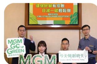
MGM Go Green Club

We continue to support energy conservation by turning off non-essential lighting and power-consuming facilities, aligning with the national "dual carbon" goal.