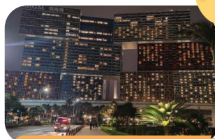
Lights Off an Hour

We continue to support energy conservation by turning off non-essential lighting and power-consuming facilities, aligning with the national "dual carbon" goal.