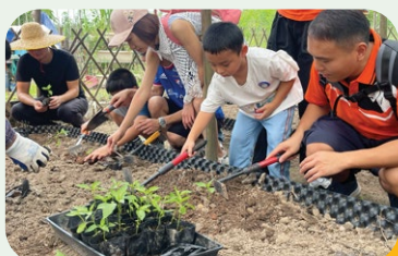
Hengqin Green Innovation and Sustainability Tour

In line with the International Day of Awareness of Food Loss and Waste, over 40 team members and their families ventured out of Macau to the neighboring city Hengqin to experience farming and understand innovative solutions for urban waste management. This experience inspired everyone to promote responsible living initiatives in the community.