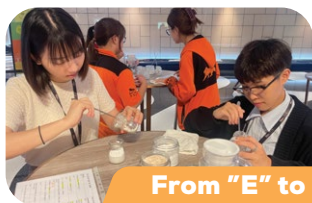
From "E" to "C", Eggshells to Coasters Eco-Friendly Workshop

Extending the popularity of eco-friendly lion coasters workshop at 2024 MIECF, which won the Champion of the Environmental Booth Award, near 100 team members experienced the creation of coasters by transforming seemingly discarded materials into valuable treasures. They are primarily crafted from eggshells recycled from our business operations, embodying the concepts of environmental protection and circular economy.