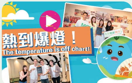
Casual Wear Summer

Around 1,650 non-uniformed back-of-house team members responded to wear light and cool clothing to work every Friday during summer, and maintain air conditioning temperature of above 25°C. It promotes a common philosophy of energy conservation while creating a comfortable working environment.