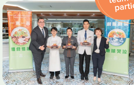
MGM 21-Day Clean Your Plate Challenge

Around 1,650 non-uniformed back-of-house team members responded to wear light and cool clothing to work every Friday during summer, and maintain air conditioning temperature of above 25°C. It promotes a common philosophy of energy conservation while creating a comfortable working environment.