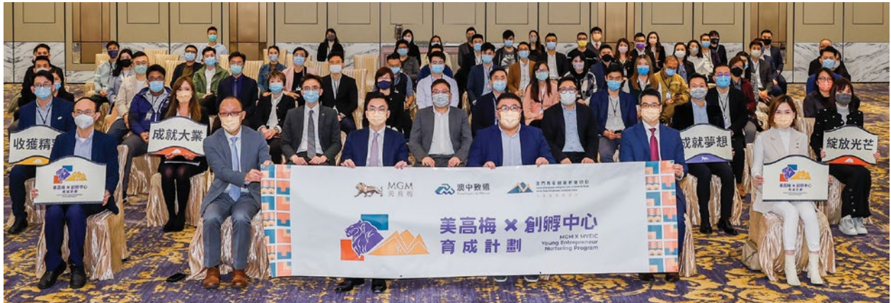
The second edition of the “MYEIC x MGM Young Entrepreneur Nurturing Program” was officially launched on March 23.